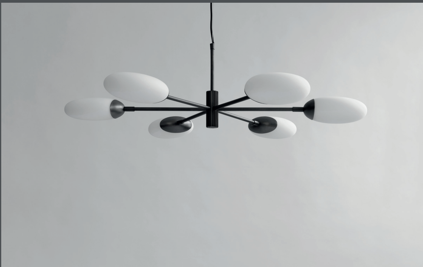
SALON CHANDELIER - OPAQUE