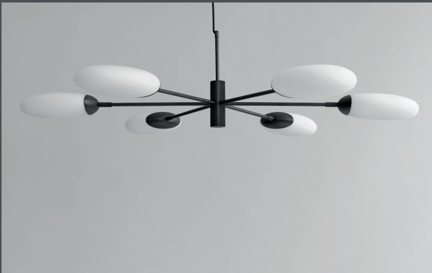
SALON CHANDELIER, GRANDE - OPAQUE